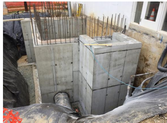
Grit System Addition

As previously discussed, we have requested costs for provision and installation of three (3) C-channel steel beams. One (1) to stiffen a concrete slab that requires partial removal, and two (2) that will be used for finish work on the cut existing masonry wall.