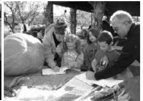
Children can have their faces painted, and families can guess the weight of West Goshen's largest pumpkin at the Harvest Festival.

Harvest Day, West Goshen's largest annual festival will be held on Sunday, October 24th. Here is information you need to know if you plan to attend Harvest Day: