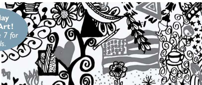
A portion of Live Laugh Love by Morgan Beard from the 2007 Resident Exhibit

Display Your Art! See page 7 for details.