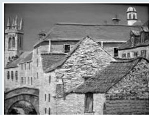
Village by Phillip Bruner from the 2005 Resident Exhibit