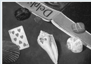
Shells by Edwin Vandernoot from the 2005 Resident Exhibit

other works of art for display. All residents of the Township are welcome to participate regardless of age or level of art education.